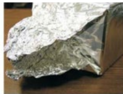
Pinch the foil on the ends and squeeze together.