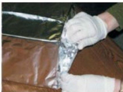
Roll the ends twice and press flat against the foam block.