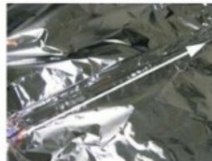
Lift the overlap, crease and fold flat for the length of the seam (26").