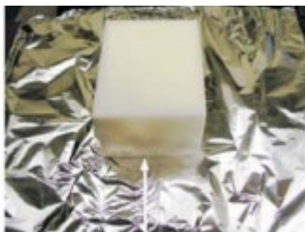
Place the foam sample in the center of the joined foil sheet lengthwise on top of the seam.